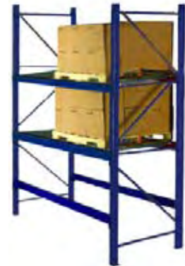
(2) 16-ft. Uprights with 3 levels of 9-ft. crossbars (6 bars) and wire decking: $228