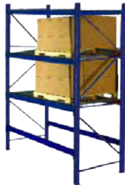
(2) 16-ft. Uprights with 4 levels of 9-ft. crossbars (8 bars) and wire decking: $264

SAVE $3,000 WHEN YOU BUY ALL BLUE RACKING LISTED HERE, WITH WIRE DECKING, FOR ONLY $29,400