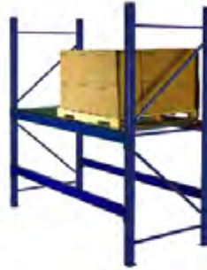
(2) 14-ft. Uprights with 2 levels of 9-ft. crossbars (4 bars) and wire decking: $132